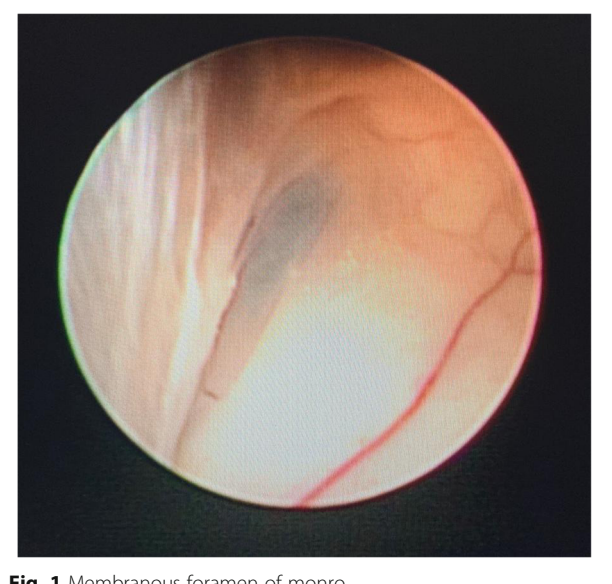
Fig. 1 Membranous foramen of monro

Success was defined by the following criteria: (1) no further intervention required to treat hydrocephalus and (2) the absence of signs or symptoms of raised